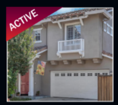
46 S. 16th St 3 Bed | 2 Bath | 1707 SQ FT $1,329,000