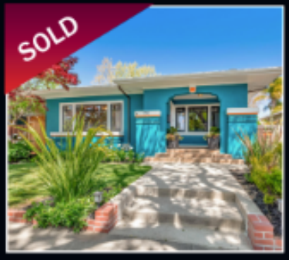
590 S. 15th St <sup>3 Bed</sup> | <sup>2 Bath</sup> | <sup>2086</sup> SQ FT Listed $1,599,000 Sold $1,710,000