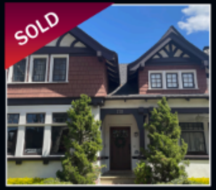
170 S. 15th St 3 Bed | 2.5 Bath | 2084 SQ FT Listed $1,749,000 Sold $1,850,000