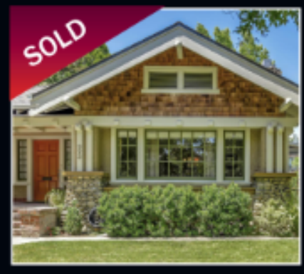
323 S. 14th St <sup>2 Bed</sup> | <sup>2 Bath</sup> | 1860 SQ FT Listed $1,498,000 Sold $1,623,000

The Faris-Taylor Team has the expertise, knowledge and experience that is so critical in Naglee Park. Let us help you sell your home for the best price possible.