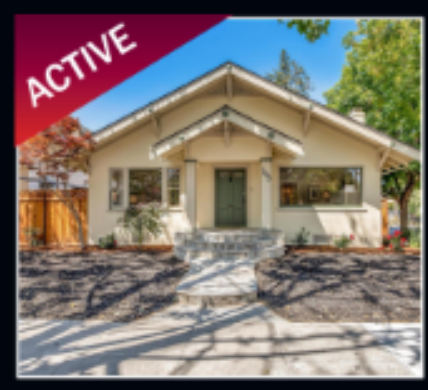
105 S. 15th St 3 Bed | 2 Bath | 2065 SQ FT $1,648,000